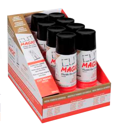
200 x 180 x 240mm